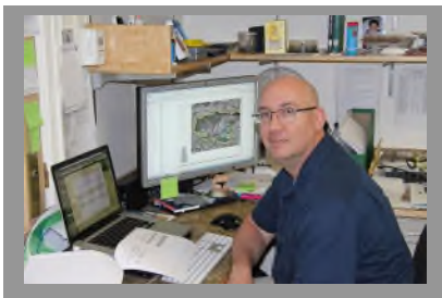
Workstation in Kirk Hall

Our PhD program supports training in physical and human geography, as well as geographical tools and techniques . The range of themes explored by our faculty is wide, however among our strengths are hydrology, urban planning, remote sensing, and natural resource management. Opportunities for conducting research are found across the globe, from Canada and the Czech Republic, to China and New Zealand. More information can be found at our website artsandscience.usask.ca/geography/ .